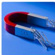
Can you block magnetism?