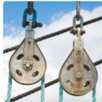
What do pulleys do?