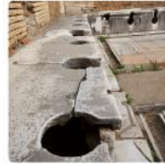
Did the Romans use toilet roll?