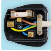
How do plugs work?