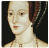
Off with Her Head!