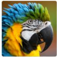
Why do birds have different beaks?