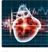
What can your heart rate tell you?