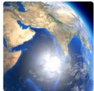
How do we know the Earth is round?