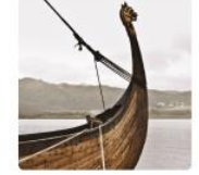
Traders and Raiders