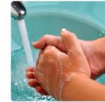
How do germs spread?