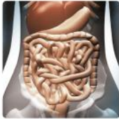
Burps, Bottoms and Bile