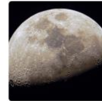
How does the Moon move?