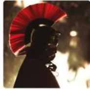
I Am Warrior!