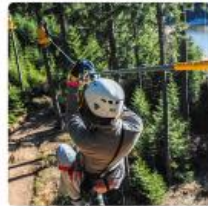
Why are zip-wires so fast?