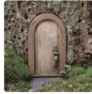
The Enchanted Woodland