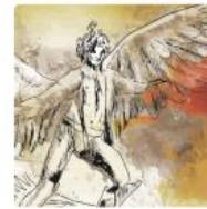
Gods and Mortals