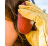
Can we block sound?