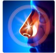
How do smells get up your nose?