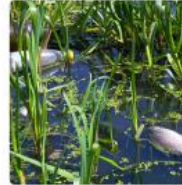
How does pollution affect habitats?