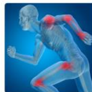
What are our joints for?