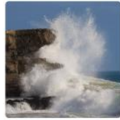
Will it degrade?