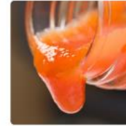
Are all liquids runny?