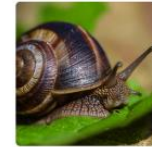
Do snails have noses?