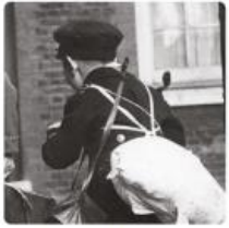
A Child's War