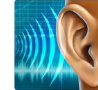
How far can sound travel?