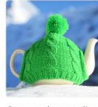
Can we slow cooling down?