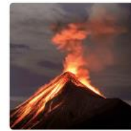
Rocks, Relics and Rumbles