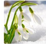
How do plants grow in winter?