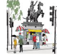
Bright Lights, Big City