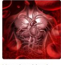
How does blood flow?