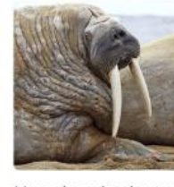
How do animals stay warm?