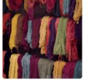
How did Vikings dye their clothes?