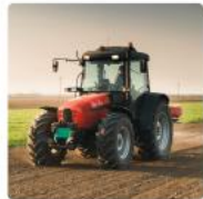
Sow, Grow and Farm