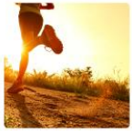
Why should I exercise?