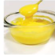
Is custard a liquid?