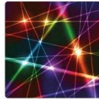
How does light travel?