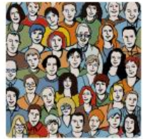
Why are things classified?