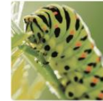
Wriggle and Crawl