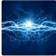
What conducts electricity?