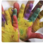
Muck, Mess and Mixtures