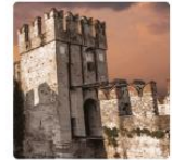
Towers, Tunnels and Turrets