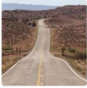
Road Trip USA!