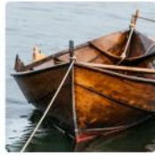
Why do boats float?