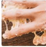
How does it feel?