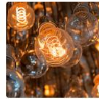
Can you turn a light down?