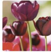
The Scented Garden