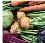
Eat the Seasons