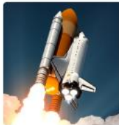
How do rockets lift off?