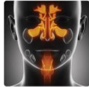
What is spit for?