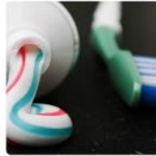
How does toothpaste protect teeth?